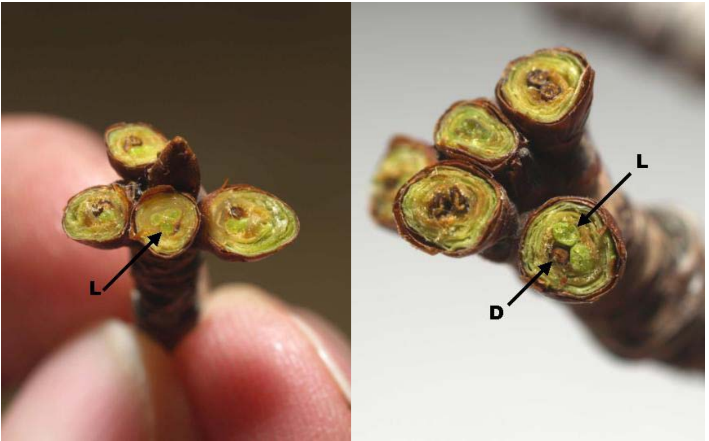
Fig. 4: Bing cherry. Left: multiple-flower bud with three live pistils (arrow); right: multiple-flower bud with two live pistils and one dead pistil (arrows).