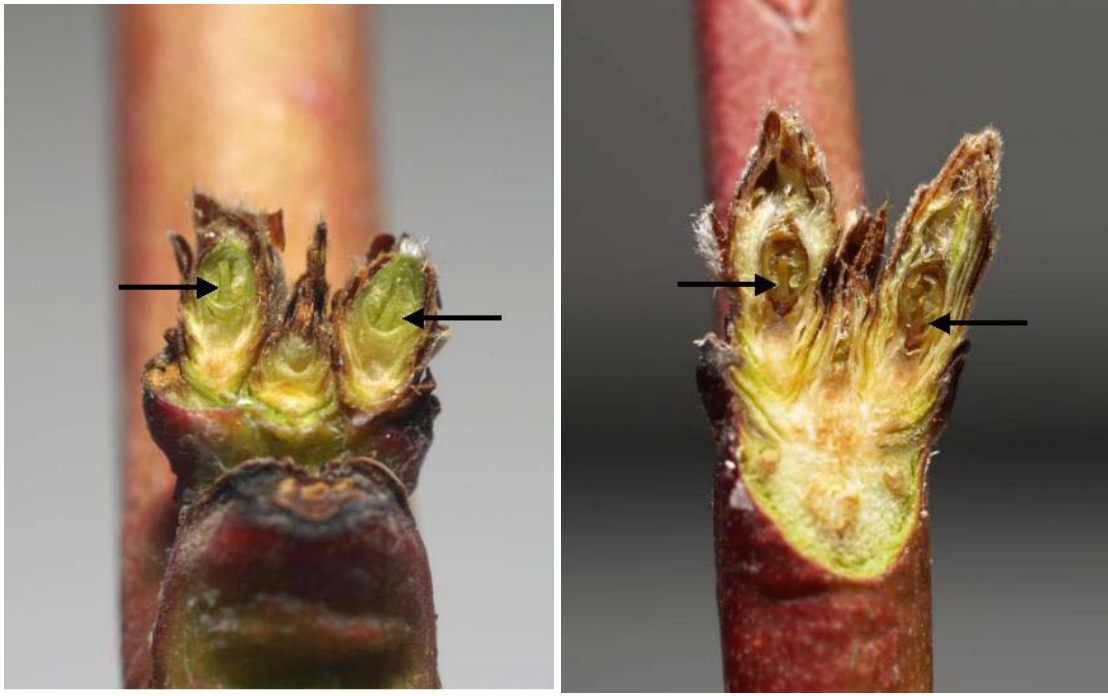
Fig. 2: BerendaSun peach. Left: live fruit pistils (arrows); right: dead fruit pistils (arrows).