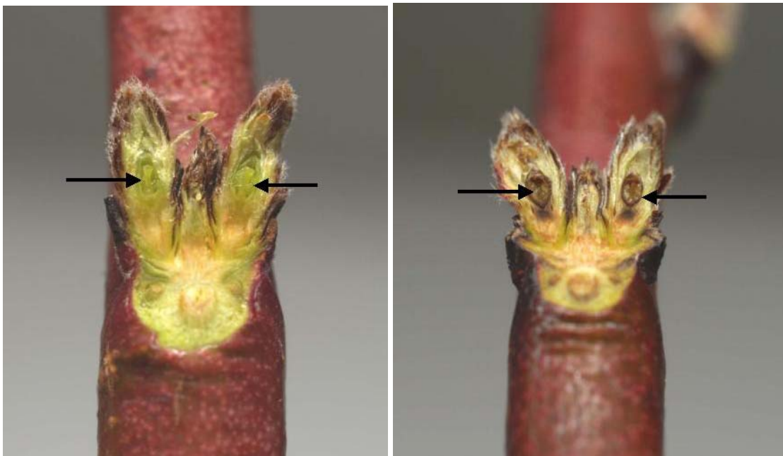
Fig. 3: Cresthaven peach. Left: live fruit pistils (arrows); right: dead fruit pistils (arrows).