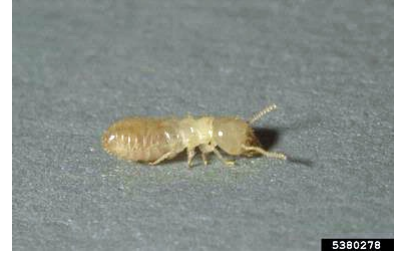
Termite worker

Typical Location When Observed: Winged adults are found swarming in or around homes. Damaged wood is found near soil or associated with mud tunnels leading from soil.