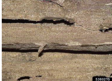
Termite damage