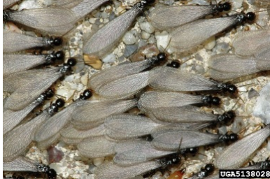
Termite swarm