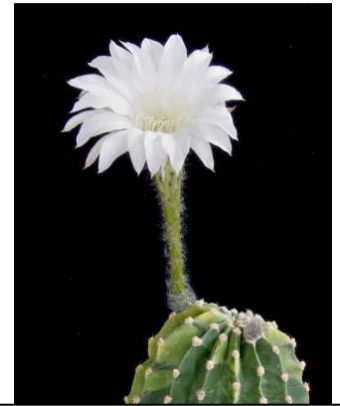
Sometimes called the Easter Lily Cactus, this variegated Echinopsis subdenudata has an impressive 7"x3.5" flower. A heavily overcast day allowed this normally nocturnal flower to remain open for two days. Don Campbell