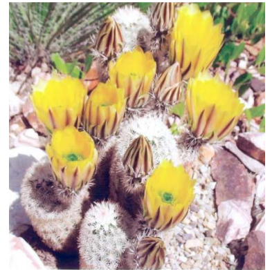
Echinocereus dasyacanthus.