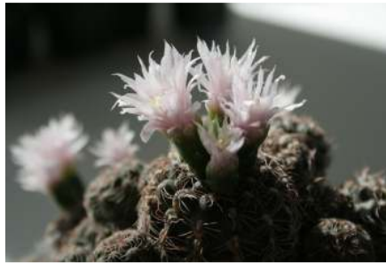
Gymnocalycium bruchii, in bloom 5-26-09 Janet Hassell