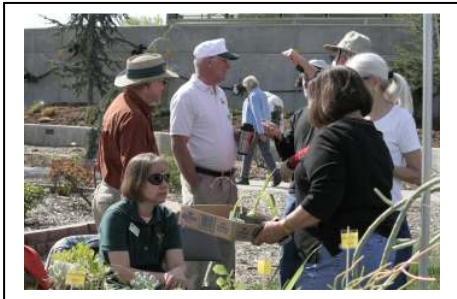
Chinle members planning their marketing strategies—relieved to have finally set up the canopy.

away prices, so perhaps we shouldn’t bother with these.