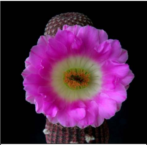
Echinocereus rigidissimus v. rubispinus in bloom 5-13-09. Flower is over 4.5" diam. Don Campbell