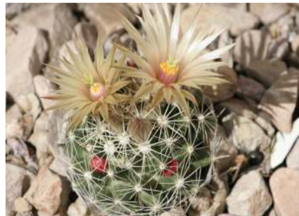
Escobaria missouriensis in bloom with fruit, 5-25-09.