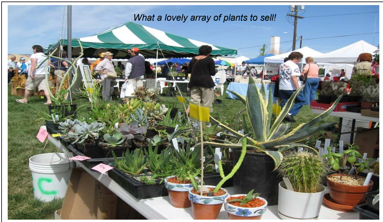
What a lovely array of plants to sell!!