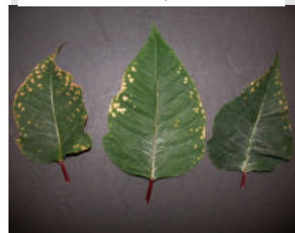
Phytotoxicity on poinsettia due to chemical application under unusually high humidity