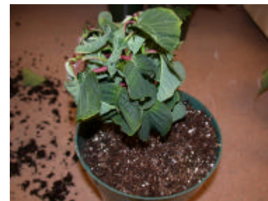
Wilting symptoms of root and crown rot

wide variety of potted plants are susceptible to these two water mold fungi. ( Phytophthora can also cause a leaf blight on tropical plants under very high relative humidity.) Rogue (pull and destroy) infected plants to help manage the problem.