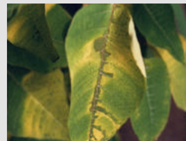
Damage to poinsettia from a copper compound applied when weather was cloudy

Poinsettias and other plants are susceptible to damage by many labeled pesticides. Why and when would a labeled pesticide cause injury? Many pesticides may burn leaf tissue when the compound is allowed to remain on the leaf for a prolonged period of time. Conditions that may allow this include high relative humidity and/or prolonged cloud cover. Under these conditions, some chemicals stay in the liquid phase a bit longer than normal, allowing cuticle transport, and hence tissue burning. Check the labels of all chemicals prior to use. If a chemical is likely to cause plant injury under certain circumstances, the precautions will be listed on the label.