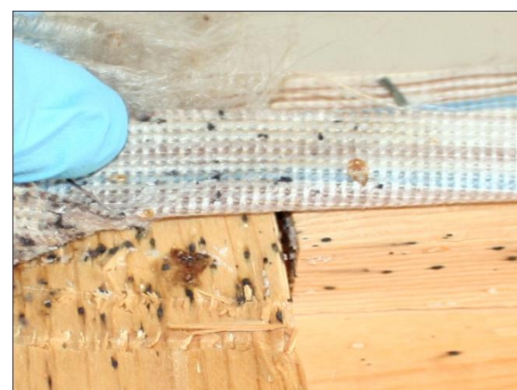
Bed bug adults, nymphs, cast skins and fecal spotting on the bottom of a box spring.