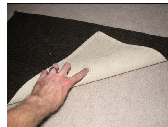
Bed bug fecal spotting on the bottom of a rug.