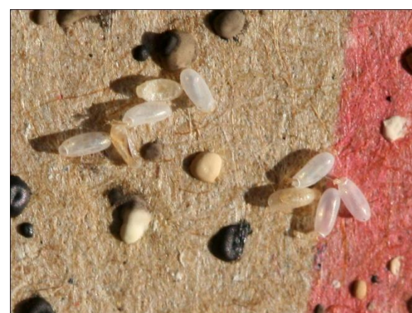
Bed bug eggs and fecal spotting.

Where would I find bed bugs? The great majority of bed bugs will be on or in the near vicinity of sleeping sites used by humans. Bed bugs feed at night, always avoiding light, and spend the rest of the time tucked in cracks and crevices such as mattress seams and box springs, corners of bed frames and side tables, or behind molding and pictures.