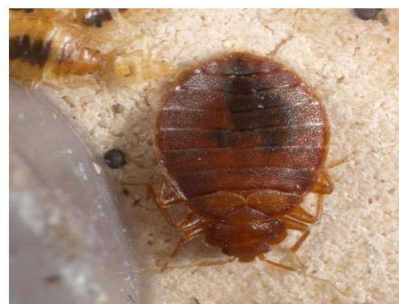
Bed bug nymphs.

Bed bugs tend to group in dark enclosed areas to rest between feeding events. These aggregation sites may be indicated by spotting produced by bed bug excrement, oval cream colored eggs, old skins from molted bed bugs as well as various active life stages.