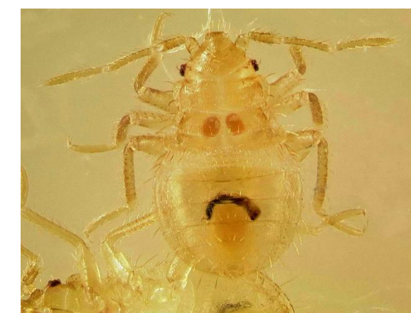
Newly hatched bed bug nymph.