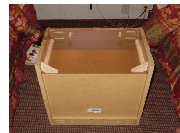
Bed bug hiding areas on the underside of a nightstand.