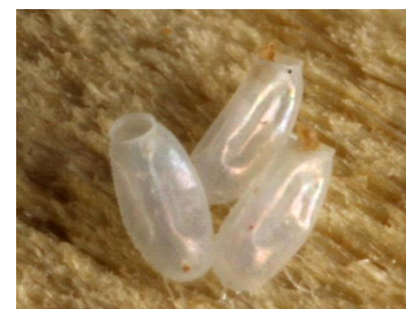
Hatched bed bug eggs.

Bed bugs tend to group in dark enclosed areas to rest between feeding events. These aggregation sites may be indicated by spotting produced by bed bug excrement, oval cream colored eggs, old skins from molted bed bugs as well as various active life stages.