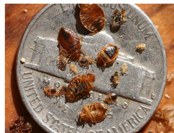
Various life stages of bed bugs.