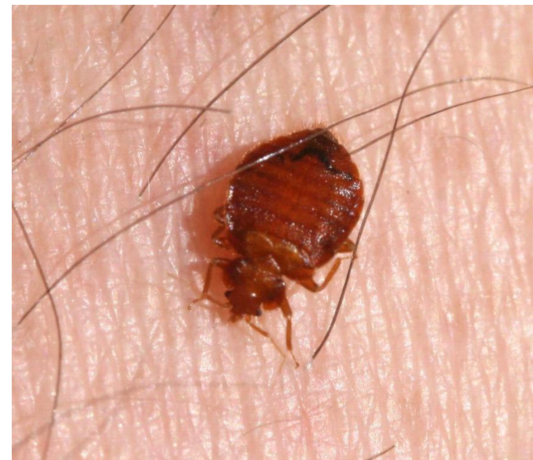
Adult bed bug settling on a human arm to feed.

However, immature stages that have recently hatched are much smaller and a range of sizes representing different life stages are normally present. The smaller stages of bed bugs are lighter brown than the adults and a dark area may be visible in the center of the body.