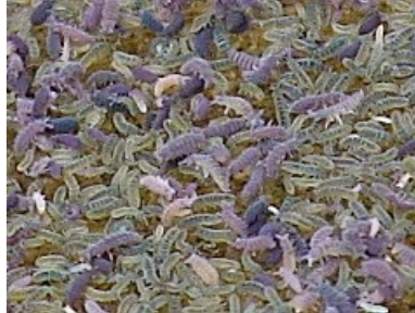
Large mass of springtails (collembola.org)