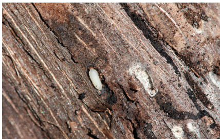
Damage is produced by the tunneling of the developing walnut twig beetle larvae, although TCD is largely related to the effects of the colonizing fungus.

Host plant vigor may affect the rate of disease progression. Although there is no evidence that vigorously growing black walnut is resistant to attack by walnut twig beetle, TCD appears to be a disease of energy depletion, which results from the disruptive effects of cankers. Therefore, highly vigorous trees with good energy stores can be expected to survive longer after being colonized by infective walnut twig beetles.