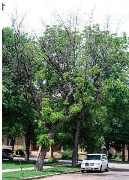
Crown thinning, foliage flagging and dieback of individual limbs are often the first symptoms of TCD infection. Once such symptoms are present, trees are typically in advanced stages of the disease and likely will die within two to three years.

There are many factors that can affect TCD severity and progression of the