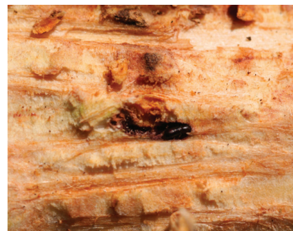
The walnut twig beetle acts in concert with a fungus, Geosmithia morbida , to threaten walnut species with thousand cankers disease.

the tunneling of the developing walnut twig beetle larvae, the disease is largely related to the effects of the colonizing fungus. In susceptible hosts (for example, J. nigra ) it grows readily around the galleries of the walnut twig beetle, producing an extensive dead area (canker) in the cambium about the size of a quarter. New cankers result when new beetles tunnel to produce egg galleries, and eventually limbs become massively compromised. In TCD end stages, cankers may coalesce to kill extensive areas of the cambium, at which point external symptoms begin to appear.